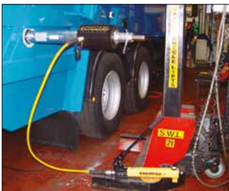
◀ An RACH-306 powered by a P-392 hand pump used to extract corroded carriage pins of refuse collection vehicles.